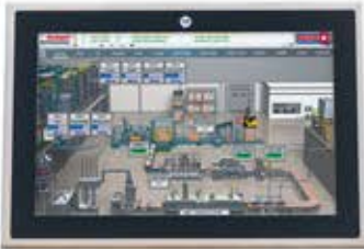
6300P Stainless Steel Panel PC

ASEM™ 6300 Industrial PCs are available in box and panel form and allow for greater customization compared to the OptixPanel™ graphic terminals. Innovate with FactoryTalk® Optix™ software and seamlessly deploy your HMI solution to the ASEM™ 6300 device that best fits customer needs.