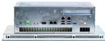
6300P Low Profile Panel PC (Back)