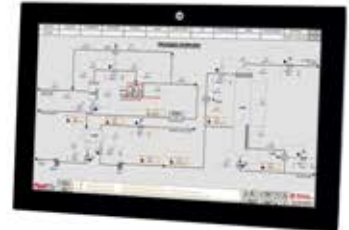
6300P Low Profile Panel PC (Front)