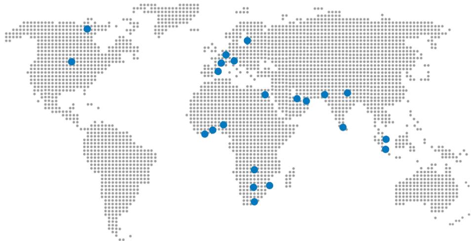
Figure 1: Global Markets We Serve

Our reputation precedes us as we proudly serve leading publishing houses globally. The stamp of quality is reinforced by our ISO 9001:2015 and ISO 14001:2015 certifications, reflecting our commitment to excellence, environmental stewardship, and ethical business practices. Additionally, our FSC: COC certification ensures responsible sourcing of materials.