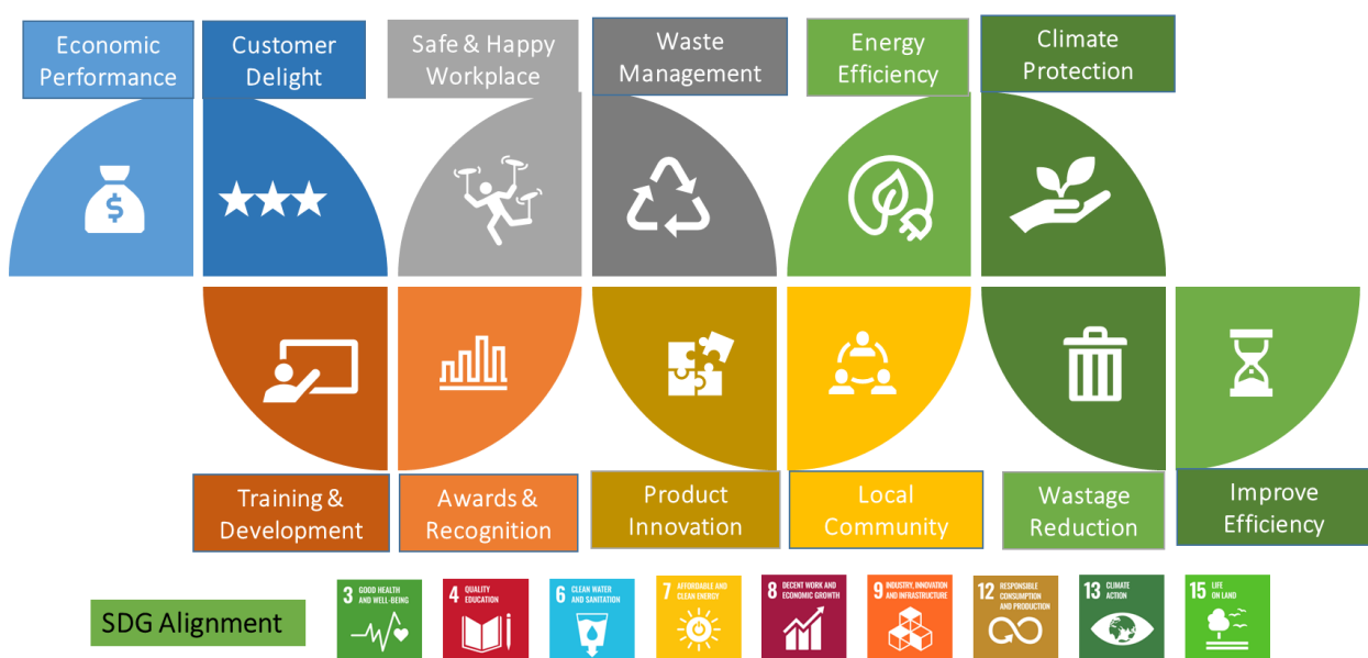
Figure 3: Material Issues

It's worth noting that a double materiality process was employed in this assessment. This approach ensured not only a thorough understanding of the external stakeholder landscape but also an in-depth exploration of MVGPL's internal considerations, aligning with the principles of double materiality within the context of sustainability reporting in the print industry. Through this comprehensive process, the final list of material topics was refined and strategically mapped, emphasizing the dual perspective of MVGPL's impact on the external environment and the influence of external factors on MVGPL's sustainability performance.