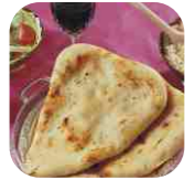
Food & Beverages